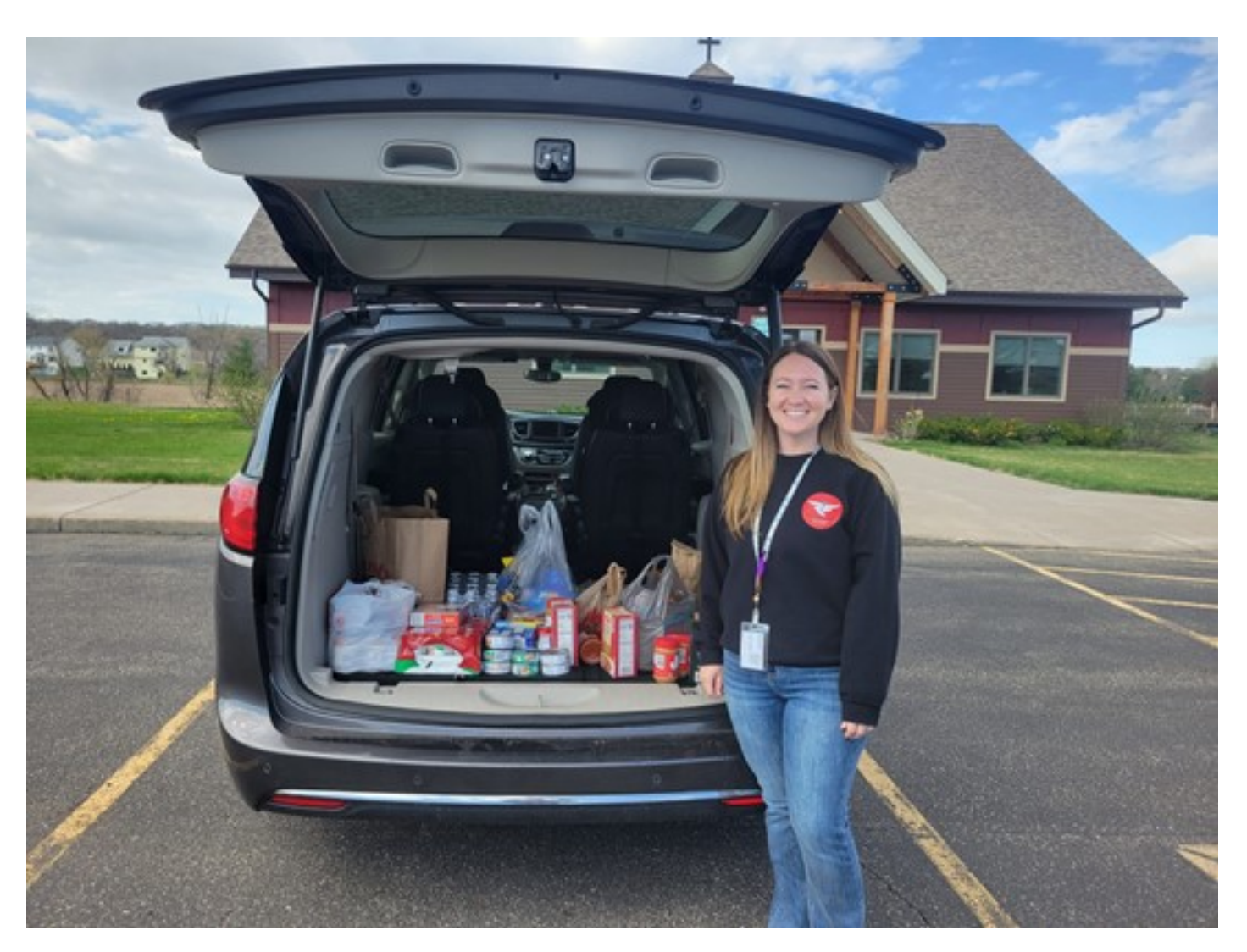
THANK YOU TO ALL WHO DONATED FOOD ITEMS TO THIS COMMUNITY CAUSE!

<u>UWRF Falcon Links</u> aims to provide guidance, support, and resources to these students so they can get their basic needs met and be successful college students. Many of the Falcon Links students are first generation college students. They often fall below the poverty line, lack a support system, and cannot get their basic needs met. Falcon Links helps to get students resources such as housing over school breaks, employment, food, hygiene items, access and navigation of healthcare, mental health resources, dental care, eye care, and other resources! If students can't get their basic needs met, it becomes nearly impossible to be a successful student. Falcon Links helps make both happen. Make sure to click on the link above to see the full scope of what Falcon Links does!