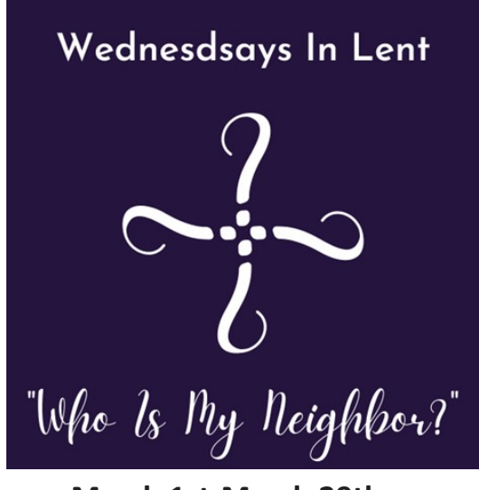
March 1st-March 29th 6:00PM Soup Supper 6:30PM Worship

As followers of Christ, we are called to love our neighbors. To SEE them, not through our own eyes, but as God sees and loves them.